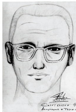
Sketch of what Zodiac Killer was thought to look like